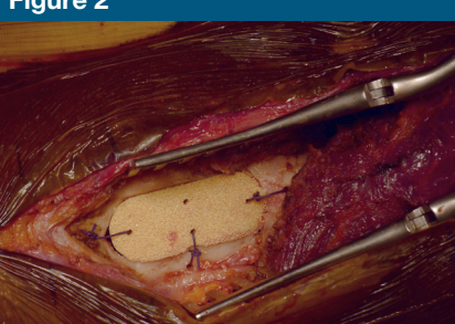
The porous alumina ceramic device stuck in the femoral cortical bone after débridement. Suture threads are used to maintain the device during the first step of healing.

eral months before, he experienced an open fracture after a fall at 7 m. An external fixator was used, but an infection occurred and was not properly treated. After fixator removal, he moved to France and came to the outpatient consultation with a chronic bone infection lasting for 18 months. Clinically, he presented with a chronic skin fistula with pus at the lateral aspect of the thigh. He did not have temperature. The C-reactive protein was <5 mg/L. CT scan revealed bone destruction on the distal diaphysealmetaphyseal part of the femur (Figure 1). Microbiological samples (percutaneous core bone biopsy) revealed an MRSA sensitive, among other, to gentamicin, vancomycin, ofloxacin, and rifampicin.