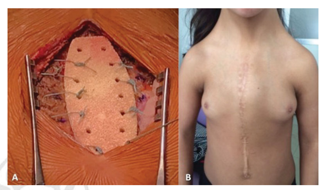
Fig. 2 (A) Peroperative view of I.Ceram porous alumina sternal prosthesis insertion with sutures; (B) postoperative view (month 12).